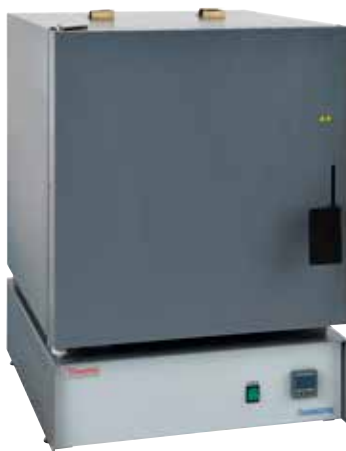
Largest tabletop muffle furnace 45L / 1.6 cu. ft

Ideal for safe operation with a range of applications including annealing glass, determinations of volatiles, catalyst research and ashing organic and inorganic samples