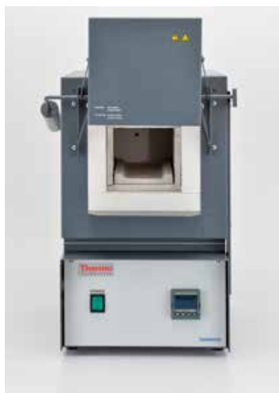
Industrial benchtop muffle 2.2L / 0.08 cu. ft

Rugged design with multiple safety features and choice of two temperature control options