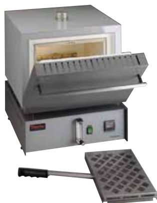
Type F6000-60 with SS shelf and handle

Warranty* : 1 year (parts and labor) Certifications : CSA certified, CE marked as indicated Required power cord and hardwiring not included.