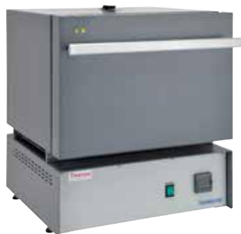
Premium large muffle furnace - 14L / 0.5 cu. ft

Robust design and choice of four temperature controllers, ideal for industrial applications including ashing organic and inorganic samples and conducting gravimetric analysis