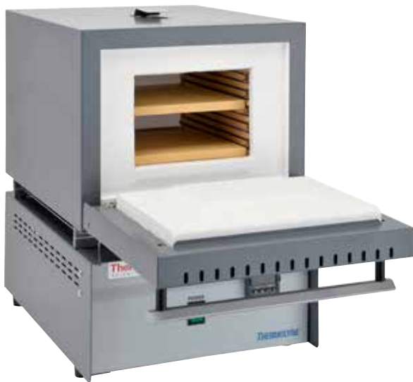
Benchtop muffle 5.8L / 0.2 cu.ft

Ideal for general laboratory use, including gravimetric analysis, sintering, quantitative analysis and heat treating